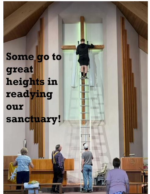
Some go to great heights in readying our sanctuary!

Our Easter feasting began with "first breakfast" donated by the Borderline Restaurant and prepared by competent kitchen volunteers.