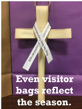
Even visitor bags reflect the season.

Much goes into preparing for Easter each year. Here are some photos of our celebration this year.